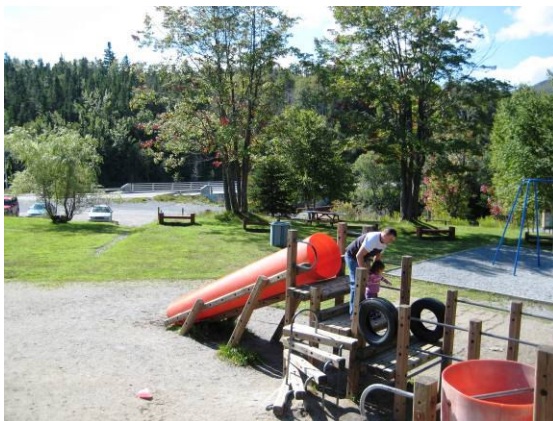
Outdated playground equipment